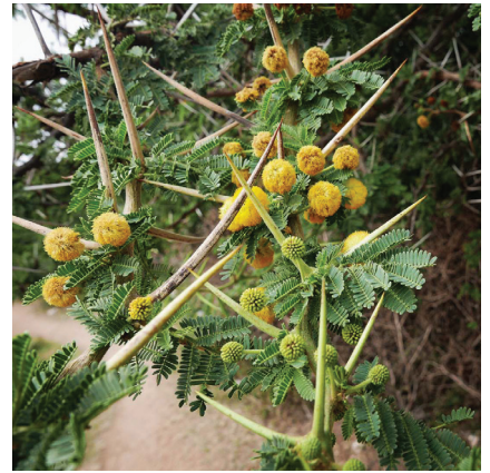
The fragrant blooms, and formidable thorns, of Acacia nilotica

In addition to training local women as beekeepers, Maasai Honey also supports local villagers by purchasing honeycomb. Beekeeping and honey production is a home industry