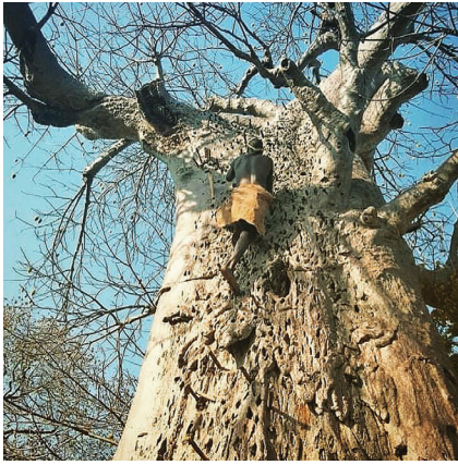
Members of the Hadzabe tribe hunt for honey in the hollows of baobab trees.

them to your Amazon Smile account should you wish. Check out their good work at MaasaiHoney.org and stay up to date with their latest projects at Instagram@maasaihoney .