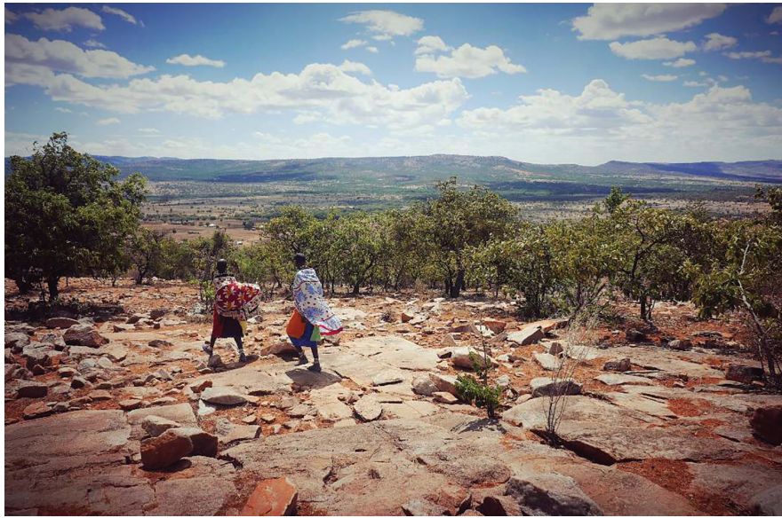
Nalari and Nasarisarau on their spectacular morning commute