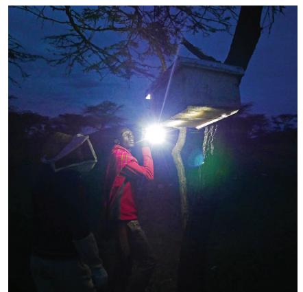
An apiary watchman inspects a bait hive in the evening hours.

Using bees and beekeeping to do a little good in the world is a common theme of my writing, and I can’t think of a finer example than Maasai Honey. Beekeeping equipment donations are always much-needed and very welcome, and you can even add